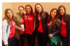
JLP CARES & HARVEST SOIRÉE: RAISED THE RECORD