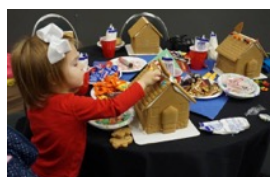
GINGERBREAD JAMBOREE: A RECORD SELL OUT