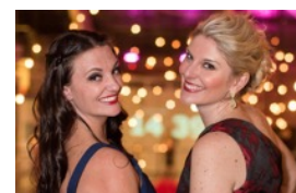
CHARITY BALL: A NEW YEAR'S EVE TRADITION