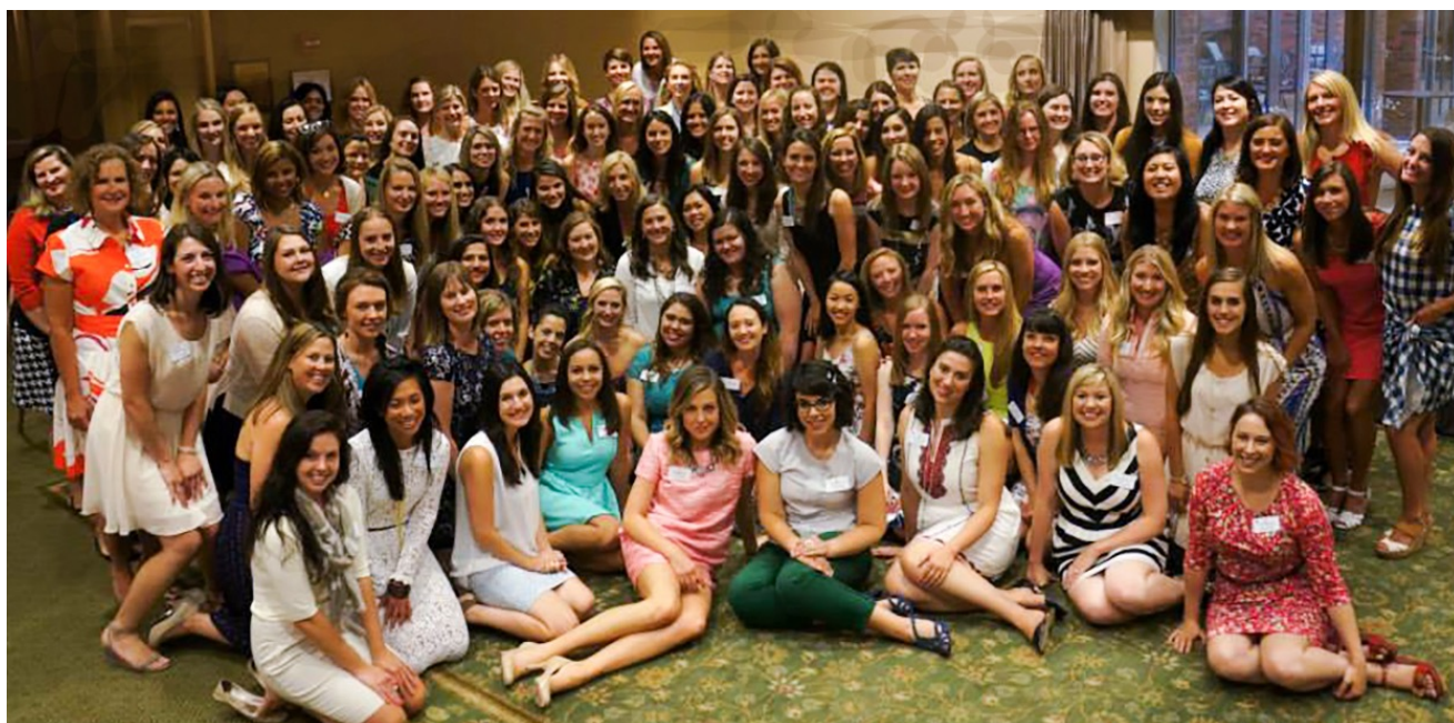
Provisional Brunch 2015