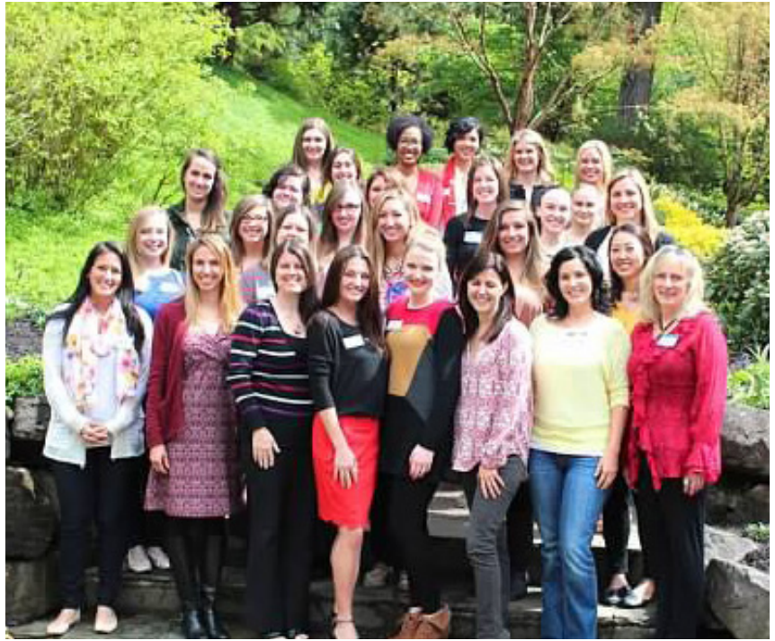
The JLP Recruitment Committee held several open houses to attract new members this year. The above photo was taken at one of those open houses in April.