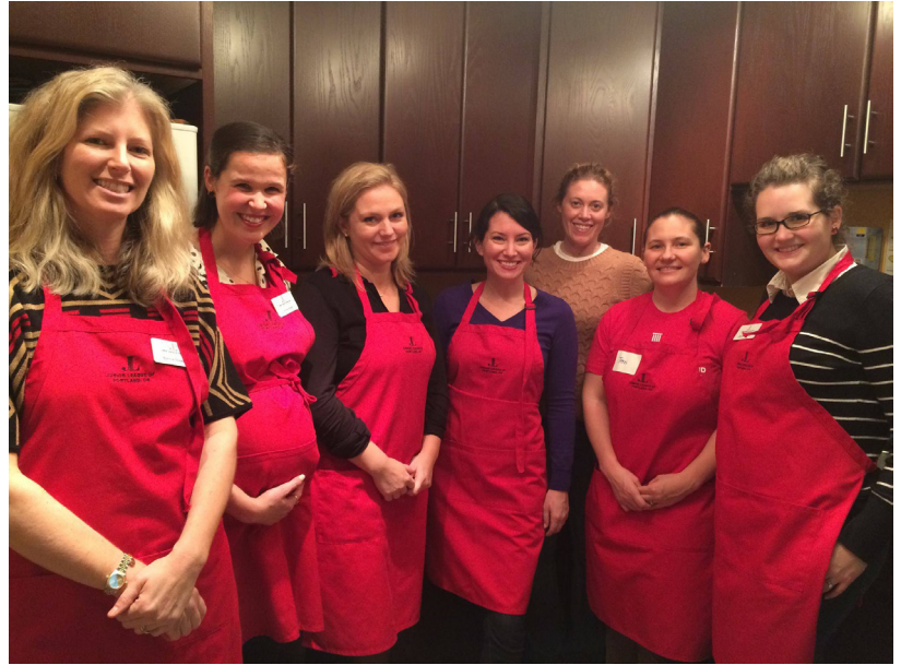
Junior League volunteers serve Thanksgiving dinner at the Bradley Angle House, one of the JLP's community partners.

January 14, 6:30 pm Provisional Meeting January 15, 6:30 pm "House Hunters" Training January 21, 6:30 pm General Membership Meeting January 22-24 AJLI Leadership Conference January 29, 6:30 pm Financial Planning 101 Training March 6, 5:30 pm Girls Inc. Power of the Purse March 11, 6:30 pm Provisional Meeting March 18, 6:30 pm General Membership Meeting March 20-22 NW Exchange April 16-18 AJLI Annual Conference