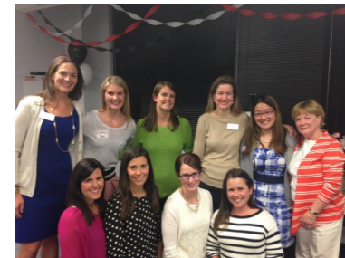
The 2014-2015 Board of Directors